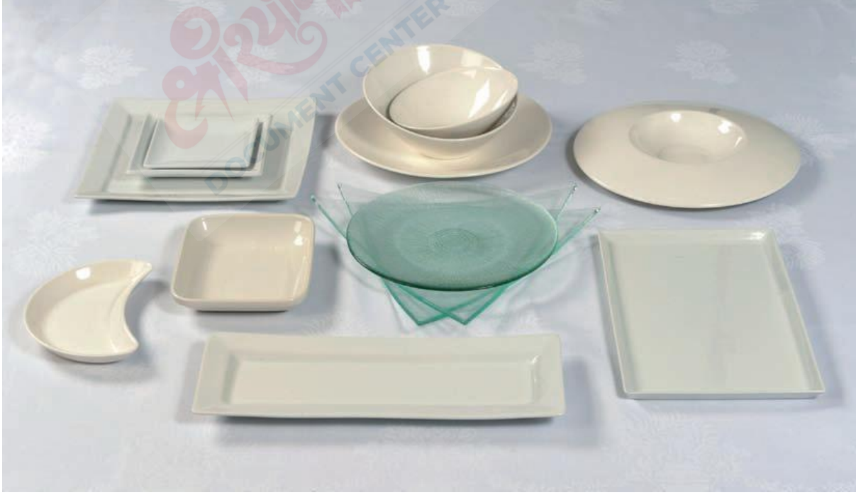
Selection of contemporary tableware