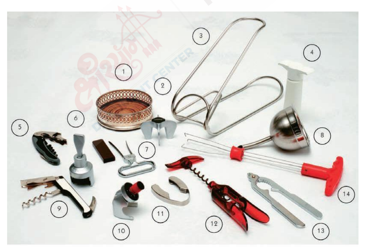
Examples of bar equipment: (1) bottle coaster, (2) Champagne star cork grip, (3) wine bottle holder, (4) vacu-pump, (5, 7, 9, 12) wine bottle openers, (6, 10) Champagne bottle stoppers,