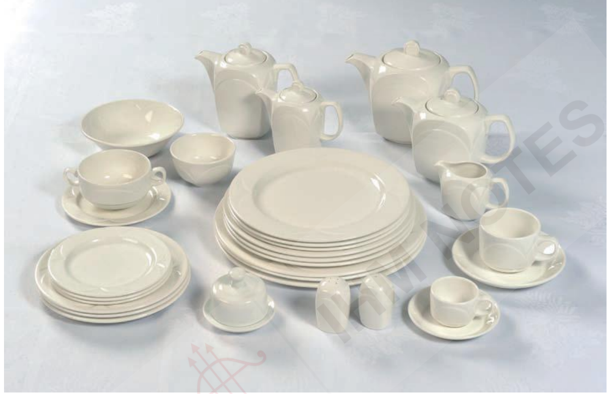
Selection of crockery – traditional style