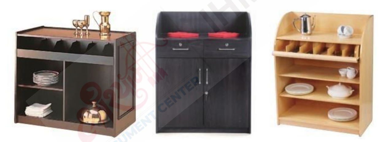
Examples of sideboards