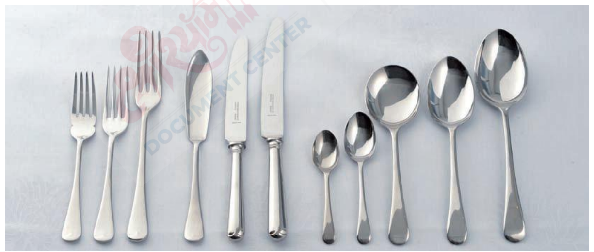
Examples of cutlery (left to right: fish fork, sweet (small) fork, joint fork, fish knife, small (side) knife, joint knife, coffee spoon, tea spoon, soup spoon, sweet spoon, table (service) spoon).

(continued) (15) appetiser bowls and cocktail stick holder, (16) measures on drip tray, (17) cutting board and knife, (18) cigar cutters, (19, 21) bottle stoppers, (20) bottle pourers, (22) crown cork opener, (23) mini juice press